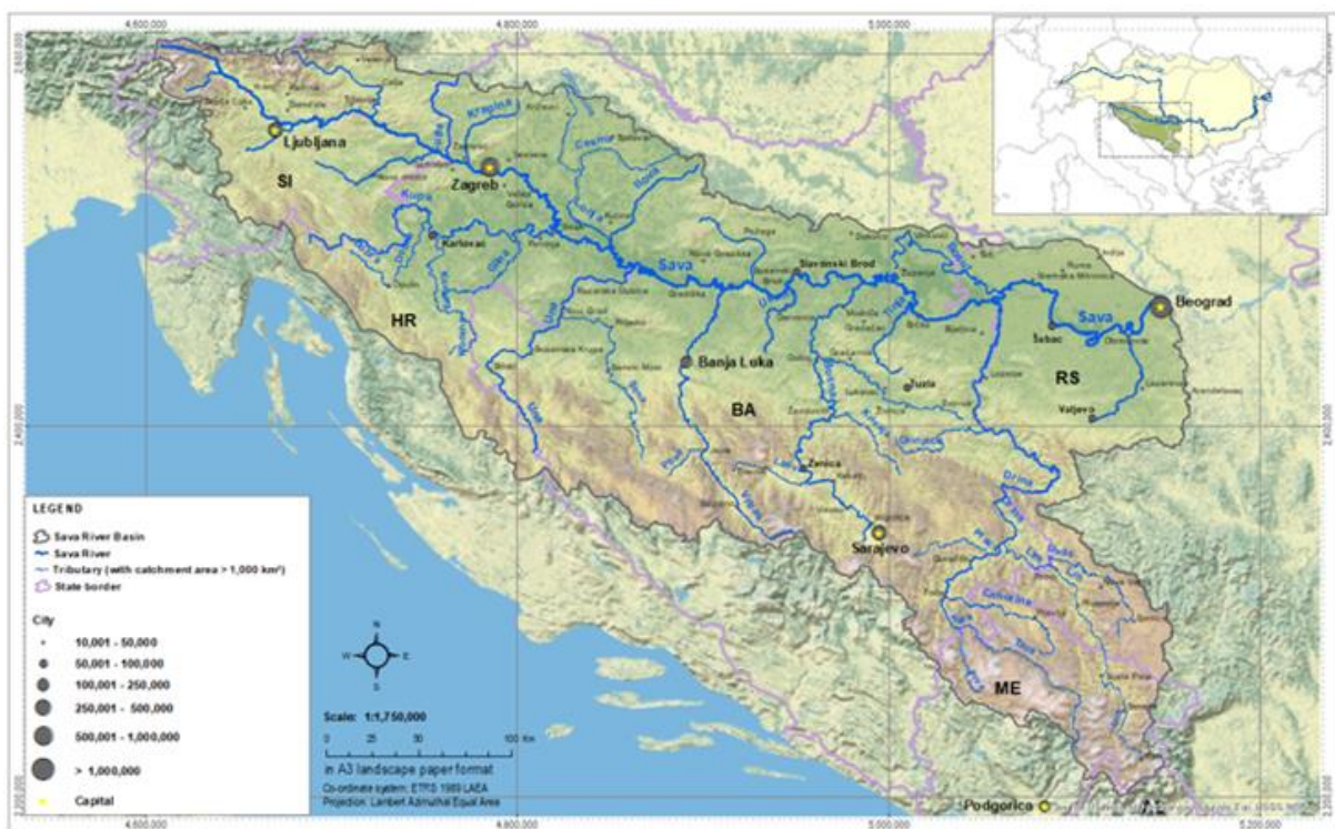
Figure 1: The Sava River Basin overview

The Sava River Basin is a major river basin of South-Eastern Europe that covers an area of approximately 97,200 km 2 . Encompassing substantial portions of Bosnia and Herzegovina, Croatia, Montenegro, Serbia, and Slovenia, the Sava River Basin constitutes 12% of the Danube River Basin area, making it the second-largest sub-basin of the Danube (Figure 1).