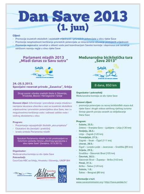
Figure 5. Posters announcing the 4<sup>th</sup> Meeting of the Parties and the other events organized by the ISRBC within the Sava Day 2013 celebration