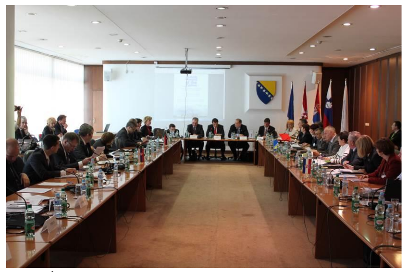
Figure 1. The 4<sup>th</sup> Meeting of the Parties to the FASRB (Sarajevo, May 31, 2013)

Significant efforts were invested during the reporting period to make further progress in the FASRB implementation, and additionally strengthen the basis for the future implementation of the FASRB by ensuring new commitments of the Parties on principal activities of the ISRBC. To this end, the 4<sup>th</sup> Meeting of the Parties to the FASRB (Figure 1) was held in FY 2013 (Sarajevo, May 31, 2013), as well as three sessions of the ISRBC: 32<sup>nd</sup> Session (Zagreb, July 9, 2013), 33<sup>rd</sup> Session (Zagreb, October 9-10, 2013) and 34<sup>th</sup> Session (Podgorica, February 18-19, 2014). Additionally, 10 meetings of the ISRBC expert groups and 34 conferences, consultation workshops and other meetings with stakeholders, were held during this period.