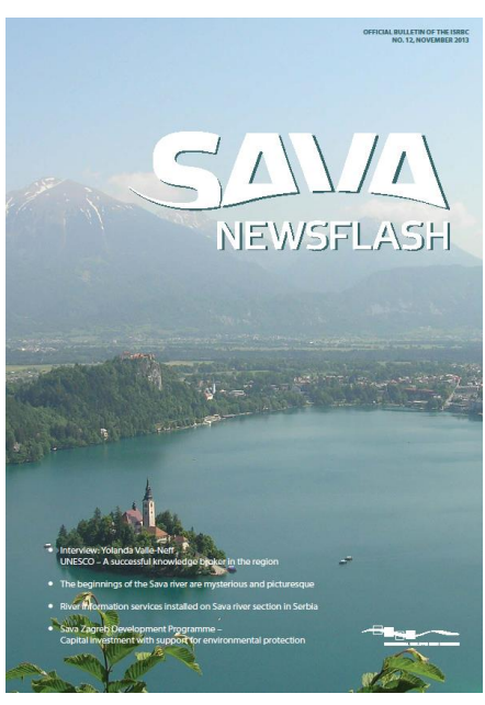
Figure 4. Sava NewsFlash No.11 (May 2013) and No.12 (November 2013)