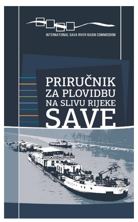
Figure 2. Manual for Navigation on the Sava River (2014)