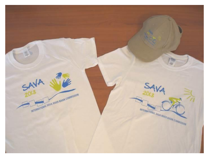
Figure 7. Promotion articles of the ISRBC

Within the celebration, a number of promotion publications and a wide range of promotion articles of the ISRBC have been distributed (Figure 7).