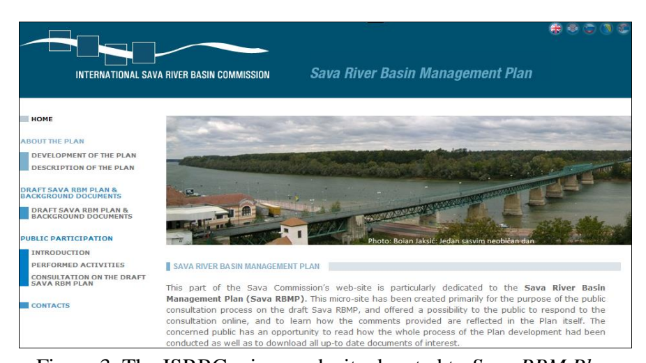
Figure 3. The ISRBC micro-web site devoted to Sava RBM Plan

The Sava RBM Plan, prepared in line with the EU Water Framework Directive (EU WFD) under coordination of the ISRBC, certainly presents a key milestone in cooperation of the Parties. A multi-year process of preparing the Plan ended in September 2012 by submission of the draft Sava RBM Plan, accompanied with 13 annexes, 22 maps and 10 background documents to the ISRBC for review. Based on the agreement on modifications of the draft Plan (version Sep. 2012) from the 31<sup>st</sup> session of the ISRBC, the revised Sava RBM Plan in all languages was submitted to the ISRBC in April 2013 for continuation of national procedures preceding the adoption. The Plan, with all supporting documents including the public consultation paper, is available at the micro-web site of the ISRBC, designed particularly for the purposes of its development (Figure 3). Additionally, the complete GIS database, used in the Plan preparation, along with the maps, was distributed to relevant institutions of the Parties in February 2014.