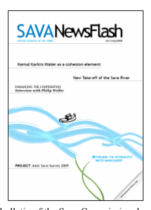
Fig. 2. The official bulletin of the Sava Commission, launched in May 2008.

Majority of the activities have been realized with a kind support of "Coca Cola Beverages Company" from the Republic of Croatia and the Republic of Serbia, and the MIO-ECSDE.