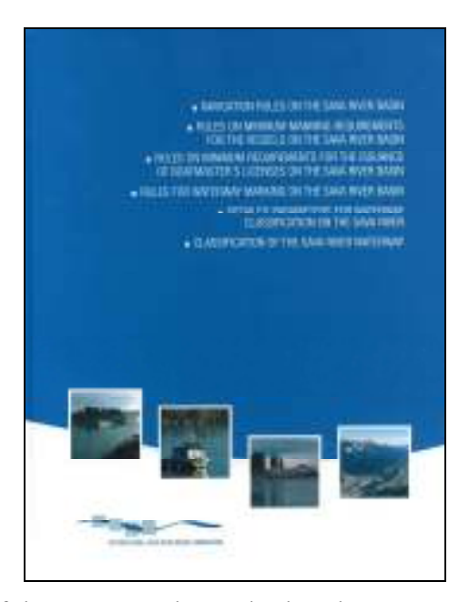
Fig. 3. Publication of the ISRBC rules and other documents related to navigation.